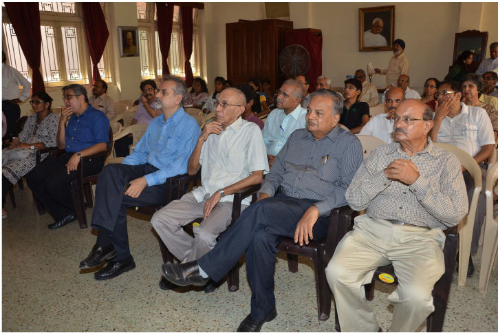
Guests viewing the presentation on activities of the Corps