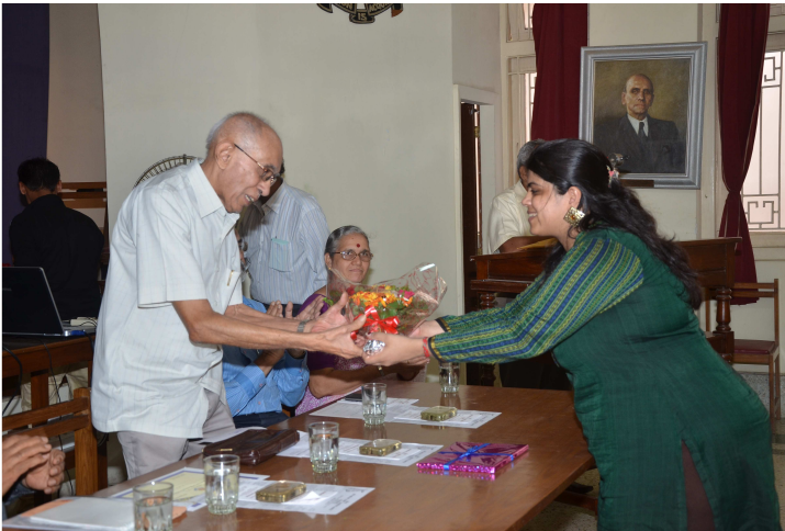
Welcome to Chief Guest with a bouquet